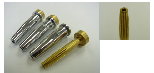
6290NX Propane – 2pc