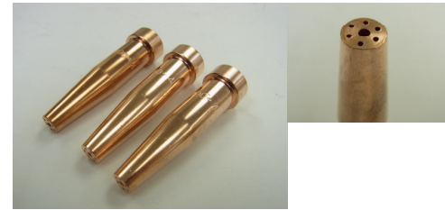
6290 Acetylene – 1pc