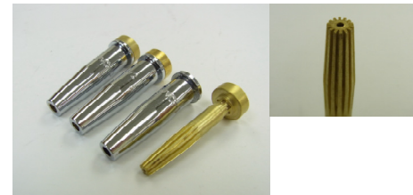
6290VVC Propane – 2pc