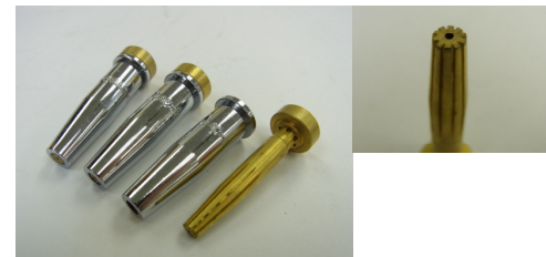
6290AC Acetylene – 2pc